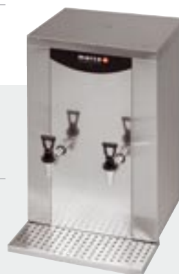
AQUARIUS 45 TT